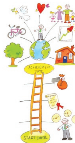
Step 6: HOW