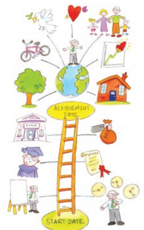
Step 7: WHO