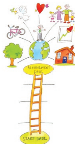
Step 5: WHEN