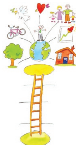
Step 4: WHY